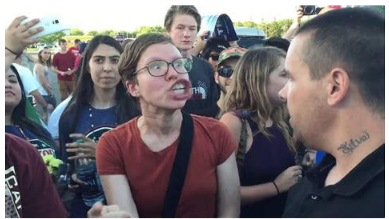
Another "attractive" Jew, demanding "tolerance"?