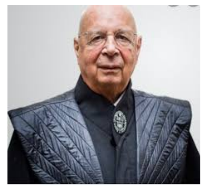
(Alien?) Klaus Schwab